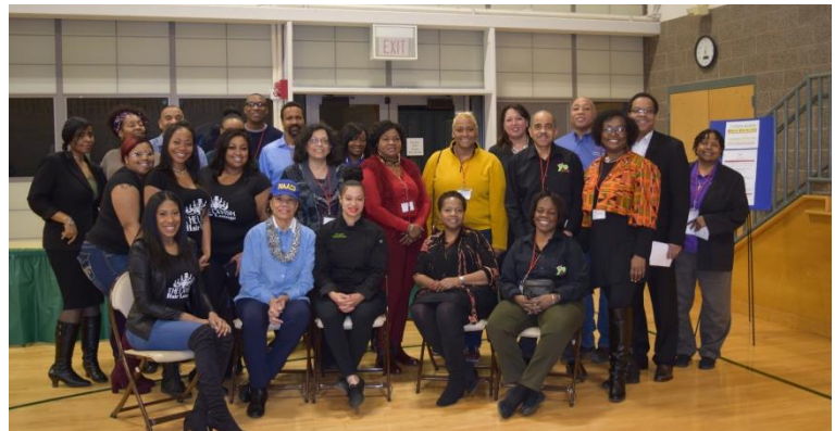
Members of the Black Business Consortium participated in the Tour De Noir business expo and bus tour in February of 2017.

black-owned businesses in Evanston drew 85 participants.