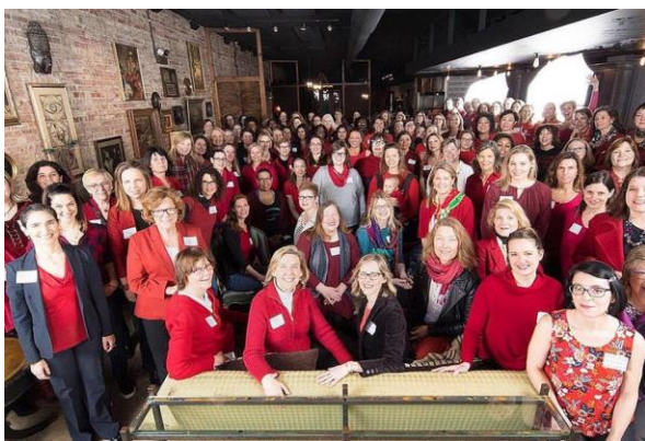
Over 100 Evanston-based Women Entrepreneurs took this photo during a networking meetup on International Womens' Day.