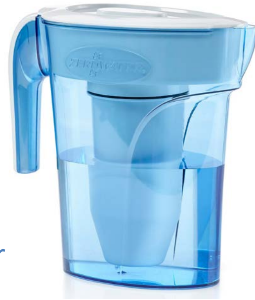
Zerowater Ready-Pour Pitcher